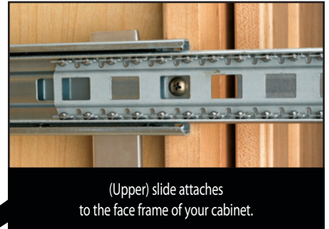
(Upper) slide attaches to the face frame of your cabinet.