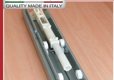
Lower Soft-Close Slide