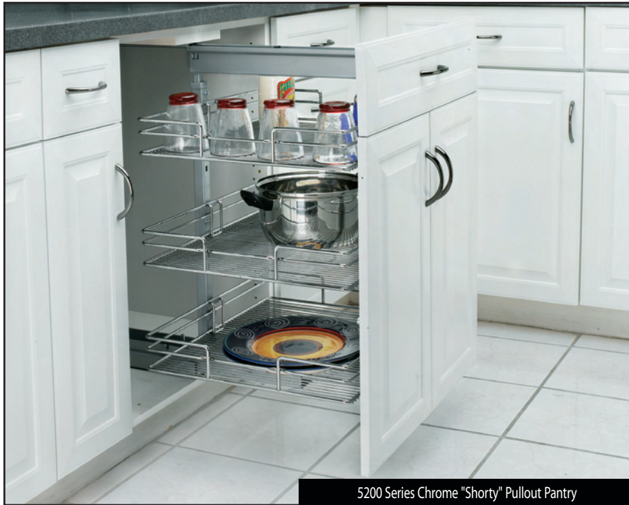
5200 Series Chrome "Shorty" Pullout Pantry