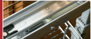
Upper Soft-Close Slide