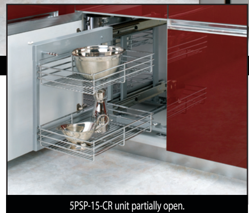
5PSP-15-CR unit partially open.