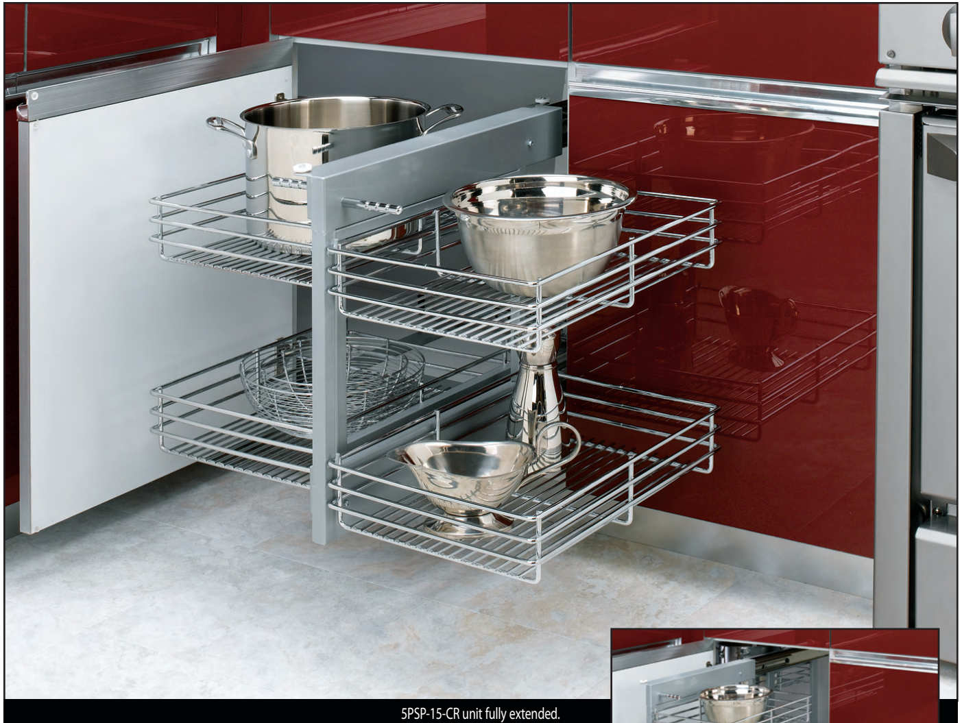
5PSP-15-CR unit fully extended.

This Non-Handed 5PSP Series maximizes space in blind corner cabinets while allowing the user full accessibility to the entire unit. The unit is easy to assemble and now installs for either left or right-handed applications. This chrome blind corner optimizer fits most 45" blind corner cabinets and features chrome accents, ball bearing slides, and heavy-duty materials making it functional, reliable and stylish. Bring organization to your fingertips, with the 5PSP Series and see how Rev-A-Shelf is changing the way you think about cabinet organization.