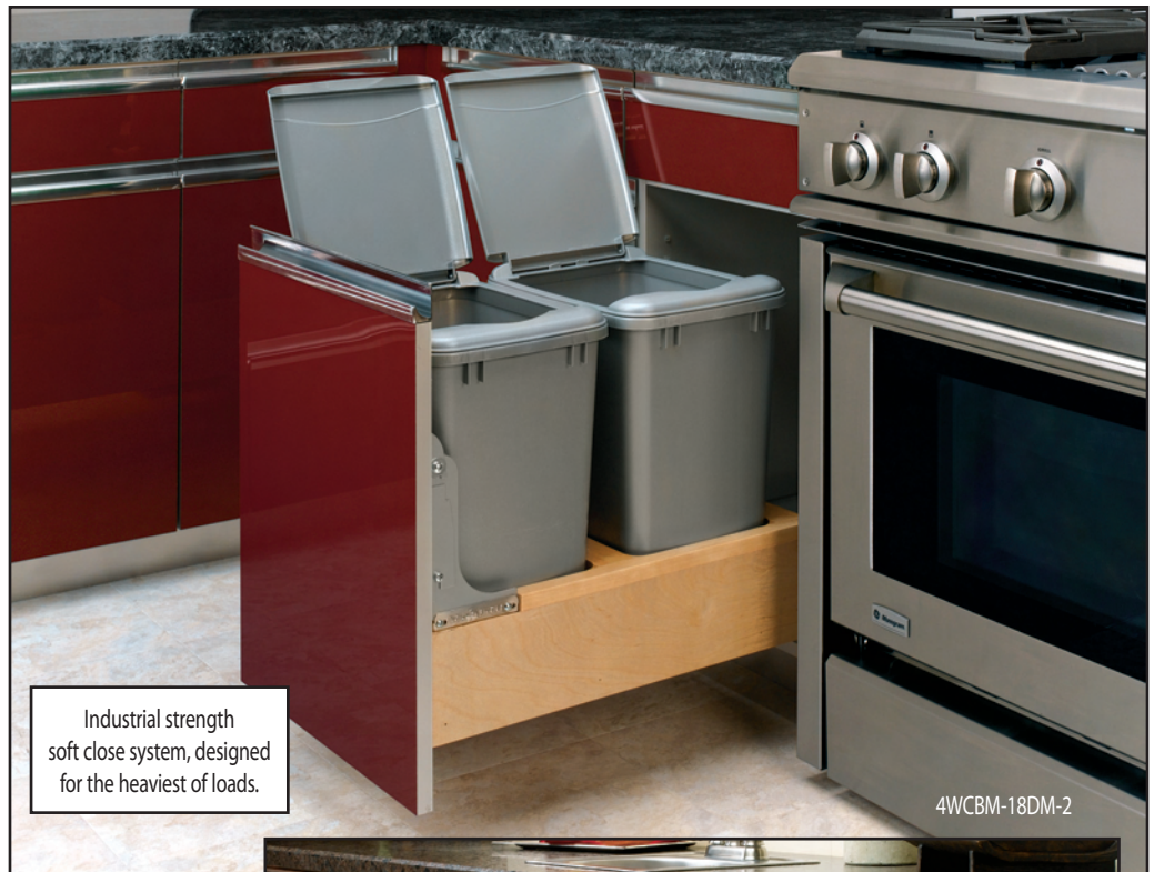
Industrial strength soft close system, designed for the heaviest of loads.

The 4WCBM Series Waste Containers are the only bottom mount units available with Rev-A-Shelf's patent pending Rev-A-Motion™ Soft Open-Soft Close slide system. The innovative gas spring assisted Soft-Open allows the unit to open smoothly and the Soft-Close shuts softly, even under the heaviest of loads. The unique design allows installation into 1½", 1⅝", and 1¾", face frame sizes, as well as frameless constructions. Available in single 35 & 50 QT or double 30, 35 and 50 QT models. All units feature metallic silver waste containers and built-in door mount brackets and many have a removable wood bin in rear for bag storage. The 4WCBM is easy to install with only five screws and features a beautiful dovetail constructed frame, concealed 150 lb. slides for a clean look.