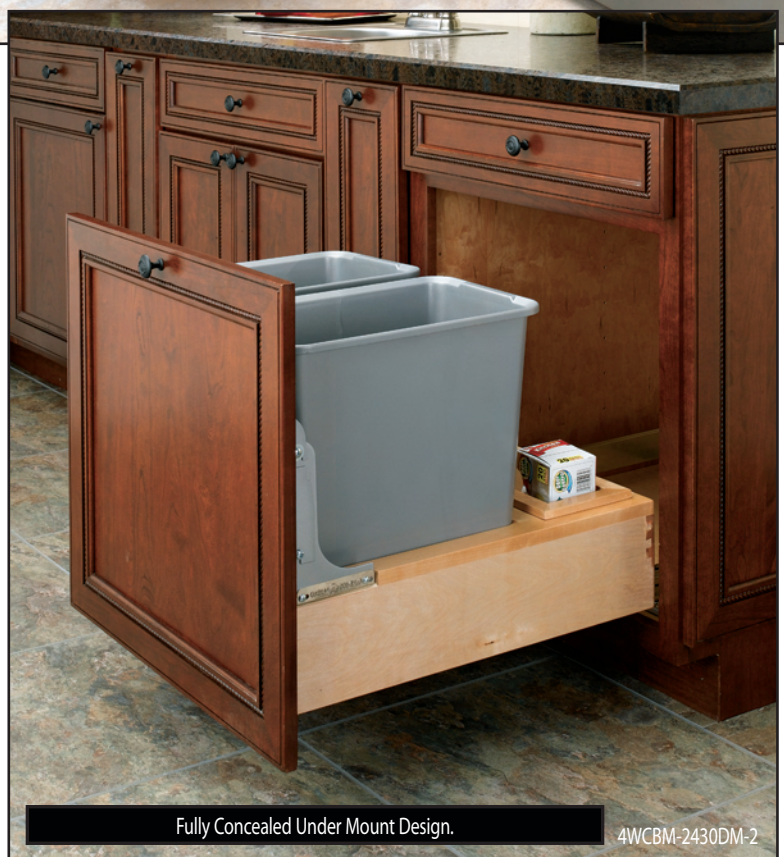
Fully Concealed Under Mount Design.