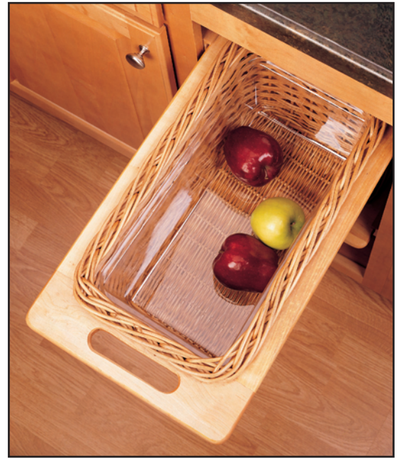
Clear Polymer Liner